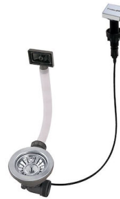
LIRA automatic waste fitting 8407 102